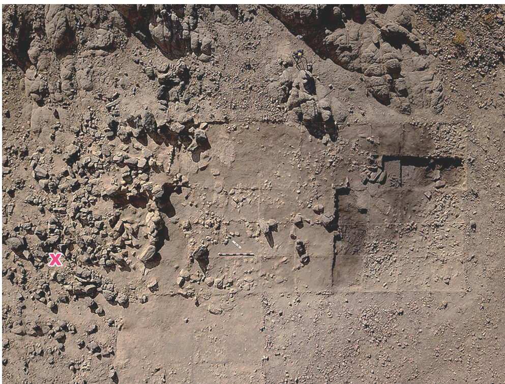
Fig. 3 Drone view of Nahal Roded 110 during excavation. The stone structure is on the left, ashy deposition on the right. The location of the vulva-shaped stone discussed here is marked on the bottom left by an X.

so brought up to the sites from some distance. Since the greatest concentration of these types of sites is around Nahal Roded, they were termed ‘Rodedian’. The lack of pottery and the presence, at some sites, of indicative lithic artefacts (mainly bidirectional blades), have led to the suggestion that the sites should provisionally be attributed to the Pre-Pottery Neolithic (Avner et al. 2014, 2019), although NR110 is currently the only site dated by radiocarbon.