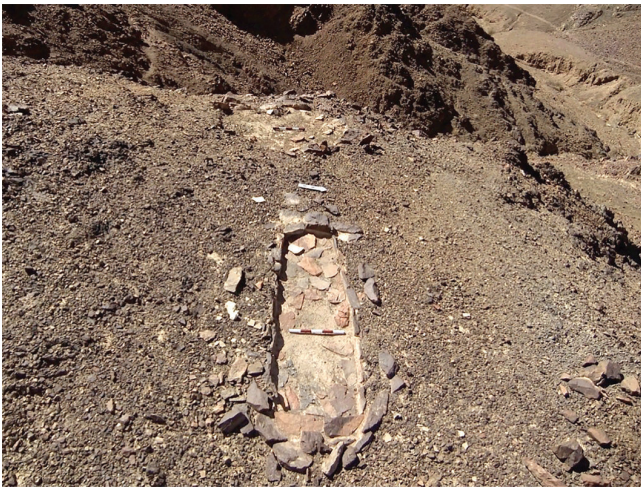
Fig 7 Har Assa (Eilat Mountains): Typical pair of low stone installations - an elongated cell pointing to a circle (scales: 0.5m).

as an iconographic proxy for the vulva appears to cut across cultures and chronologies; a global catalogue of archaeological cowrie finds, beginning in the Upper Paleolithic, was published by Kovacs (2008: 152-446). Other examples are Koerper (2001), who discussed the sex-based symbolism of cowrie ornaments in the prehistoric cultures of southern California and Singer (1940) who described a Neolithic Jomon figurine of a person wearing a giant image of the cowrie shell suspended by a cord and hanging in the biological position of a pudenda.