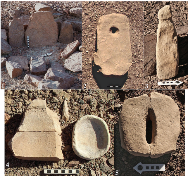
Fig. 4 Stone objects from "Rodedian" sites around Nahal Roded: 1. trio of regular standing stones (Site 63); 2. perforated fallen standing stones (Site 162); 3. anthropomorphic stone image with a hammered neck (Site 360); 4. small stone bowl and fragments of a large bowl (Site 90); 5. vulva shaped stone (Site 109).

(e.g. Stekelis 1972: Pl. 56-58; Gimbutas 1991: 223; Marshack 1991: 297; Avner 2002: 69, 2019: 29). It relates to other types of stone objects and architectural features from Near Eastern prehistoric sites, which have also been interpreted as 'vulva' images.