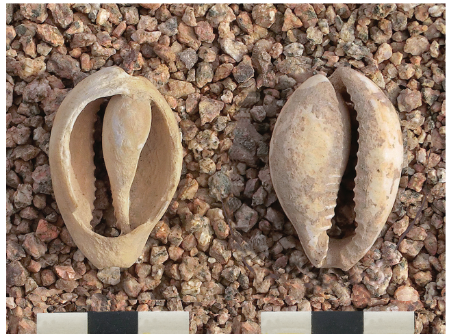
Fig.5 Cowrie shell from Nahal Roded 110, both sides.

The first group comprises pebbles or groundstone artefacts termed 'grooved stones'. They first appear in the Natufian (Belfer-Cohen 1991; Noy 1991; Bar-Yosef 1997) and continue into later periods. They are of different sizes, but all are oval-shaped and transected by a deep elongated groove. They have been described by several researchers as shaft-straighteners or sharpeners/whetstones (e.g. Cosner 1951: 147; Noy 1991; Wright 1992: 73). Gopher and Orrelle (1996) suggested that these items are both tools and vulva images. This meaning has been preserved in English etymology (Orrelle 2014: 82-83). The definition of whetstone in the Collins dictionary is "Whet (hwet, wet): to sharpen by rubbing against a whetstone – to stimulate, arouse, to whet one's appetite". A number of synonyms (slang) for female genitals reflect the connection with arrows or sharpening such as 'quiver', 'sharp-and blunt', 'grindstone' and 'whettingcorn(e)' (Ash and Highton 1987; Gopher and Orrelle 1996: Note 2). Notably, in the Levantine Early Pottery Neolithic (PN, Yarmukian Culture; ~8500-7900 calBP), vulvae are schematically de-