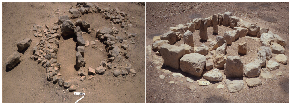
Fig. 6 "Vulva-shaped" tombs (U left and V right) in the Eilat cemetery (6th-5th millennia BC).

Orrelle (2014) tracked changing eye form in Levantine Neolithic anthropomorphic images and found that they shifted from 'female-type' eyes, i.e. vulva-shaped bisected ovals, in the PPNB to unbisected round 'male-type' eyes, by the Late Pottery Neolithic / Early Chalcolithic (Wadi Rabah Culture; ~7600-6800 calBP; Gopher and Orrelle 1996: 257, Figs. 8.1-2; Orrelle 2014: 50, 74-75). Interestingly, cowrie shells were placed in the eye sockets of plastered PPNB skulls at Jericho (Kenyon and Holland 1981: Pl. 57) and, for example, a grave offering of a perforated cowrie was recovered from a female burial at PPNB Yiftahel (Khalaily et al. 2008). The use of cowrie shells